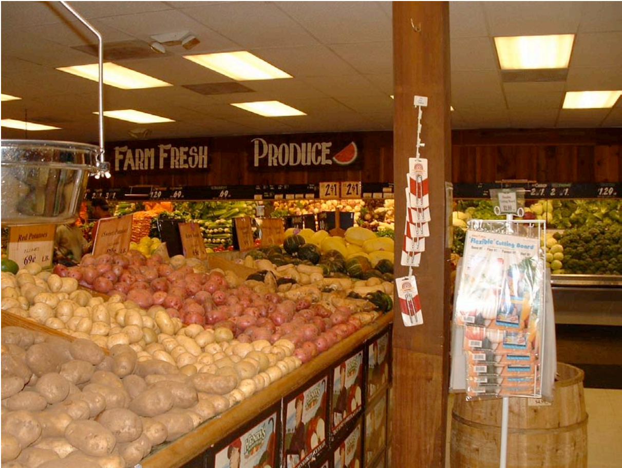
Warm Up Food Resources