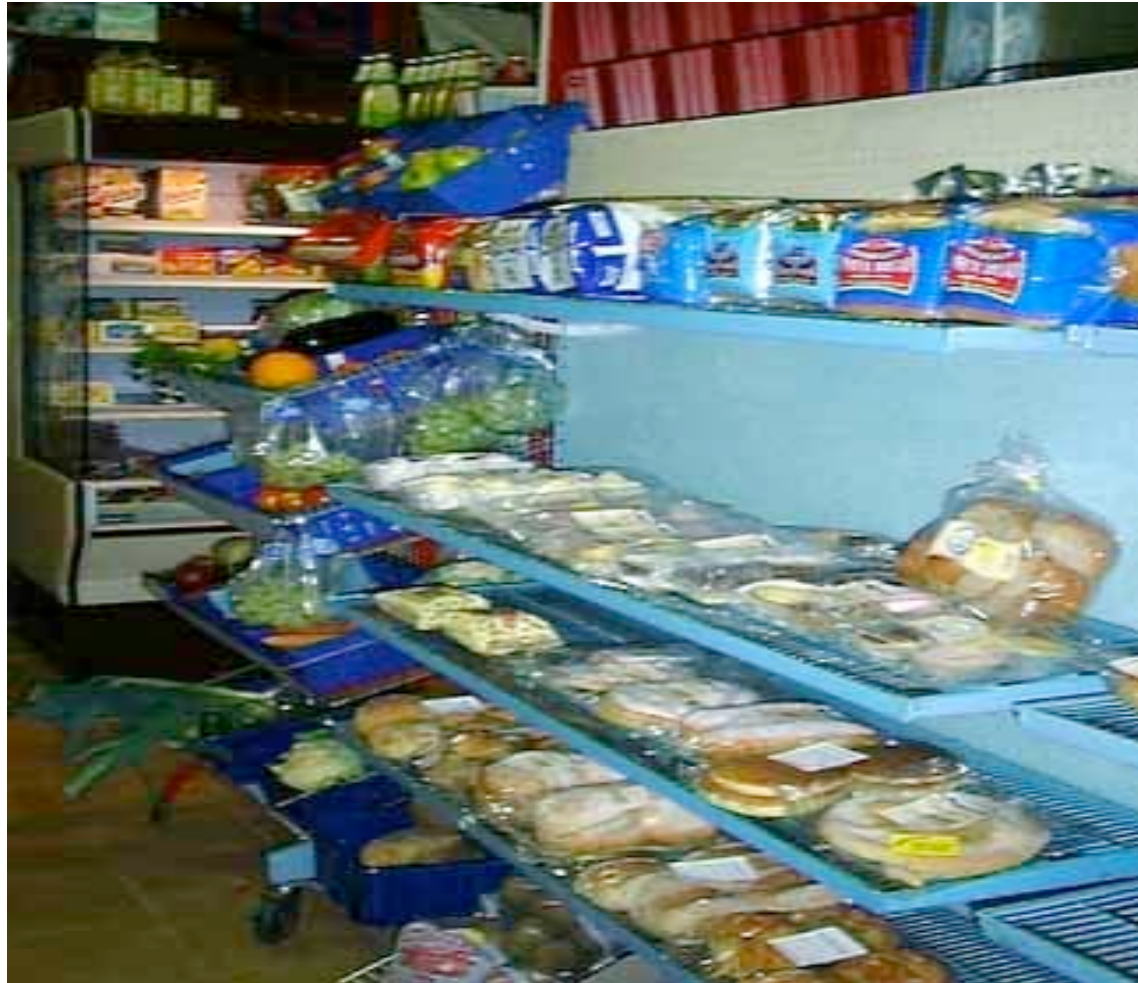
Warm Up Food Resources