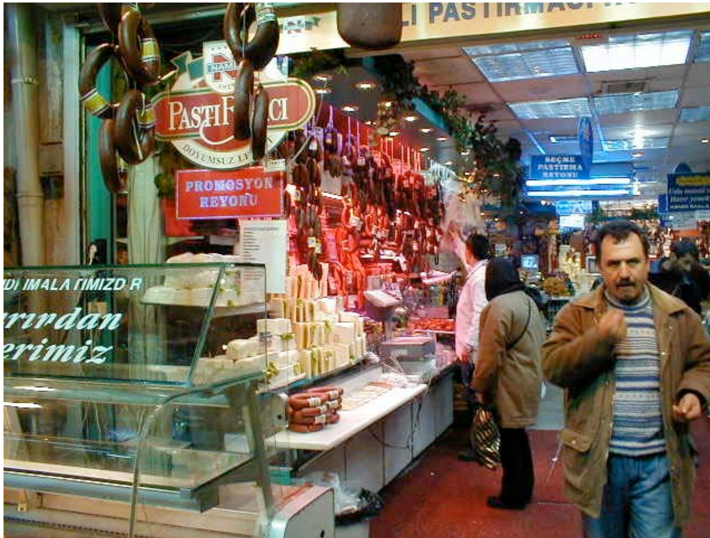
Warm Up Food Resources