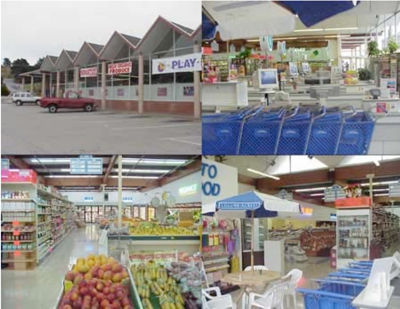
Warm Up Food Resources