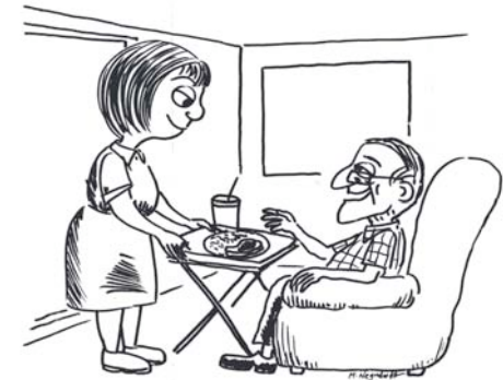
Senior Meal Program