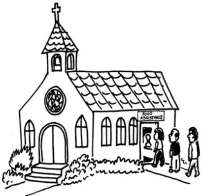
Emergency Food Assistance